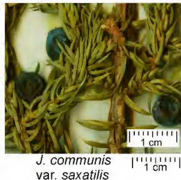
Fig. 2. Specimen of J. c. var. saxatilis from Mongolia.

The purpose of the present study was to compare the leaf volatile essential oils from J. communis , J. pygmaea and J. sibirica from Bulgaria to determine if their oils differ.